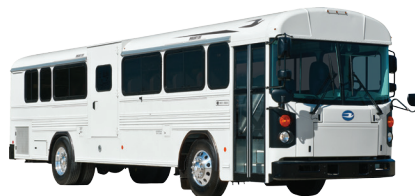
Commercial Rear Engine Bus