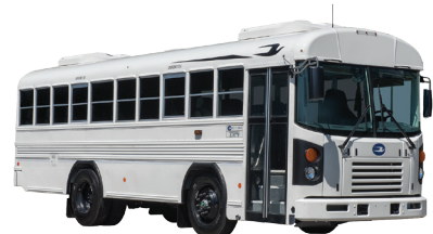
Commercial Front Engine Bus