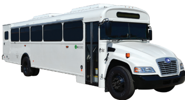
Commercial Vision Bus