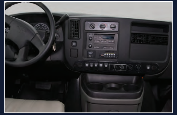
Driver friendly dash area