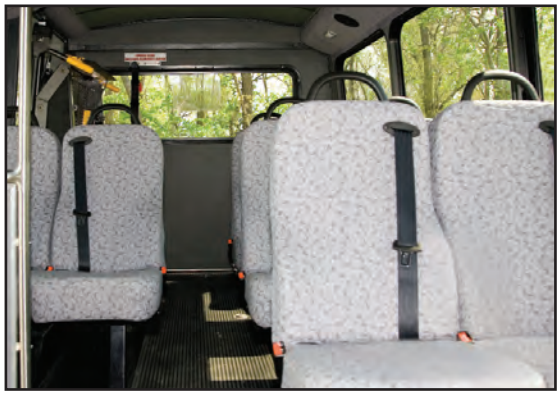
88" wide-body allows for 2&2 seating.