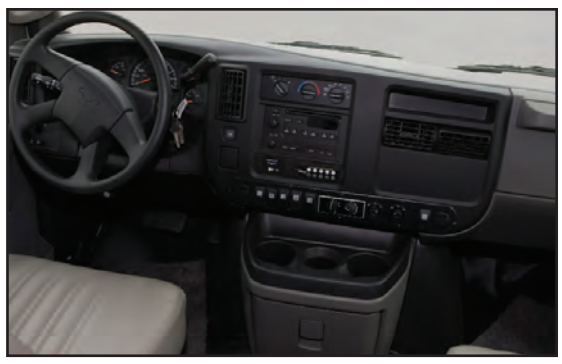
Convenient driver's console is easily accessible.