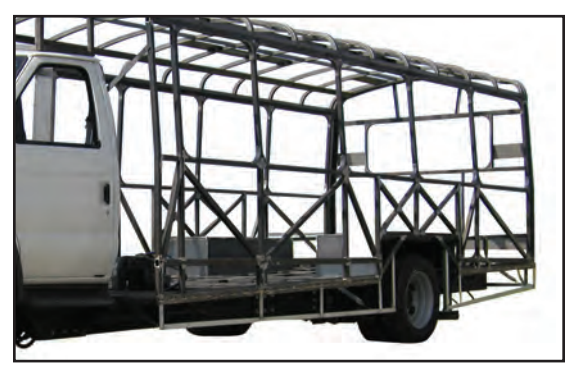
1^{1}/2^{"} \times 1^{1}/2^{"} Steelguard® construction provides superior durability.