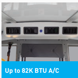
Up to 82K BTU A/C