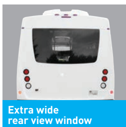
Extra wide rear view window