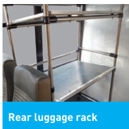
Rear luggage rack