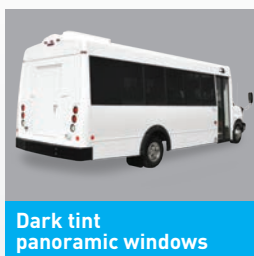
Dark tint panoramic windows